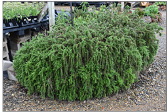
Trailing Rosemary

Trailing Rosemary features dainty spikes of lightly-scented lilac purple flowers at the ends of the branches in early spring. It has attractive green evergreen foliage. The fragrant needles are highly ornamental and remain green throughout the winter.