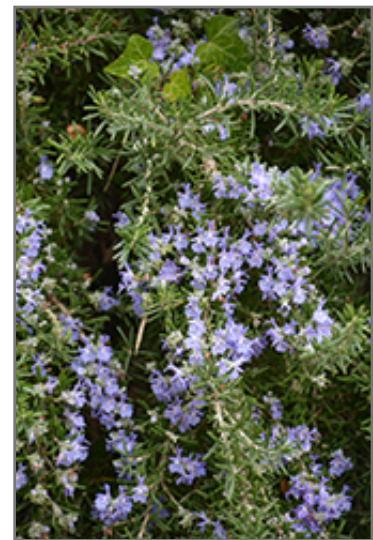
Trailing Rosemary flowers