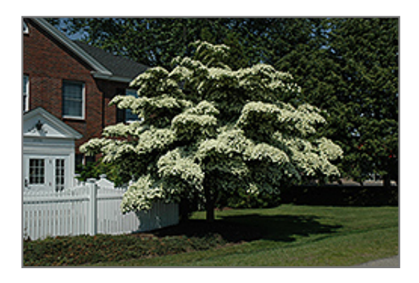
Chinese Dogwood in bloom

This is a relatively low maintenance tree, and should only be pruned after flowering to avoid removing any of the current season's flowers. It is a good choice for attracting birds to your yard. It has no significant negative characteristics.