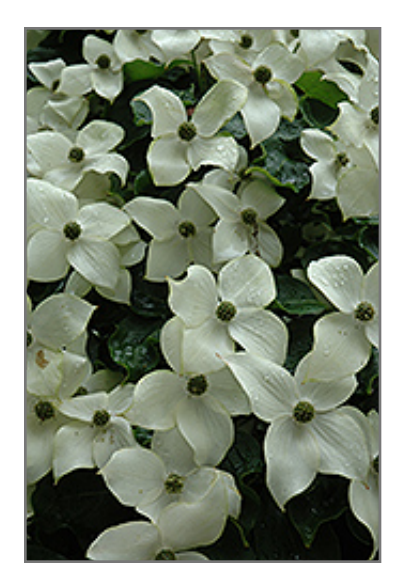
Chinese Dogwood flowers

Bandera Location 8516 Bandera Road San Antonio, TX 78250 (210) 680-2394