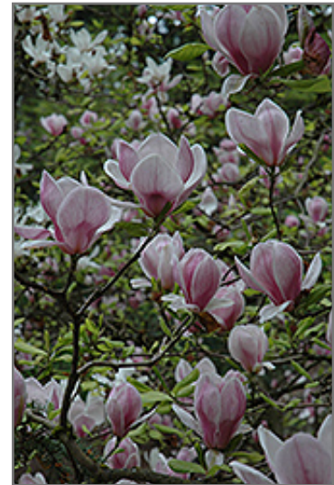
Saucer Magnolia (tree form) flowers

Saucer Magnolia (tree form) will grow to be about 30 feet tall at maturity, with a spread of 30 feet. It has a low canopy with a typical clearance of 5 feet from the ground, and should not be planted underneath power lines. It grows at a medium rate, and under ideal conditions can be expected to live for 80 years or more.