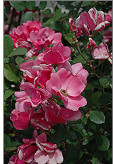
Else Poulsen Rose flowers