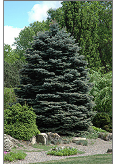
Fat Albert Blue Spruce