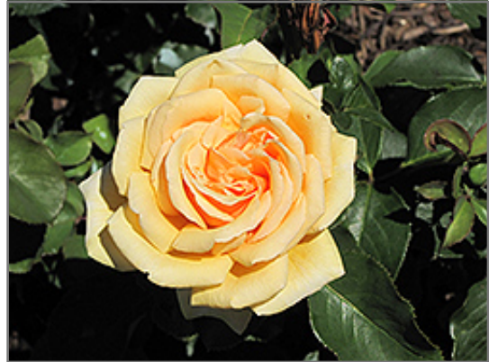
Valencia Rose flowers