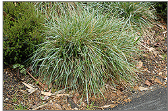
Blue Moor Grass