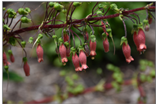
Hardy Red Gloxinia flowers