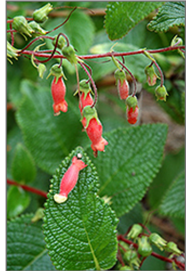
Hardy Red Gloxinia flowers