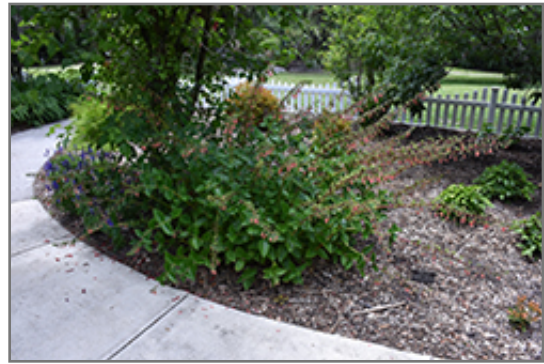
Hardy Red Gloxinia in bloom

This plant does best in full sun to partial shade. It is very adaptable to both dry and moist growing conditions, but will not tolerate any standing water. It is considered to be drought-tolerant, and thus makes an ideal choice for a low-water garden or xeriscape application. It is not particular as to soil type or pH. It is somewhat tolerant of urban pollution. This species is not originally from North America. It can be propagated by division.