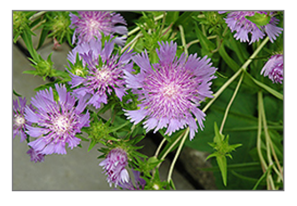
Stoke's Aster flowers