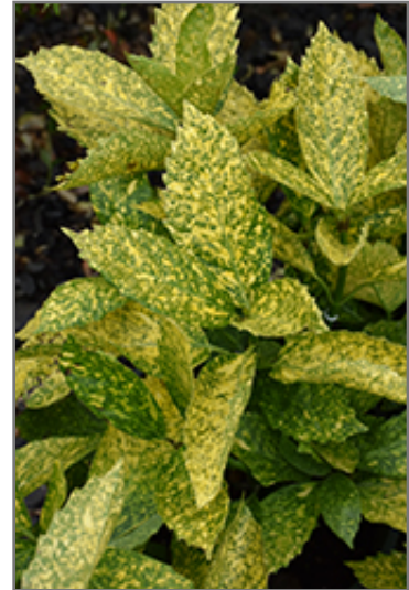
Mr. Goldstrike Aucuba foliage

Mr. Goldstrike Aucuba will grow to be about 6 feet tall at maturity, with a spread of 5 feet. It has a low canopy, and is suitable for planting under power lines. It grows at a slow rate, and under ideal conditions can be expected to live for approximately 20 years.