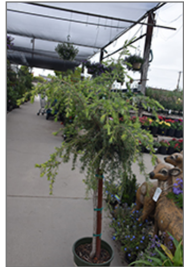
Feelin' Blue Deodar Cedar (topiary form)

This shrub should only be grown in full sunlight. It is very adaptable to both dry and moist growing conditions, but will not tolerate any standing water. It may require supplemental watering during periods of drought or extended heat. It is not particular as to soil type or pH. It is somewhat tolerant of urban pollution, and will benefit from being planted in a relatively sheltered location. This is a selected variety of a species not originally from North America.