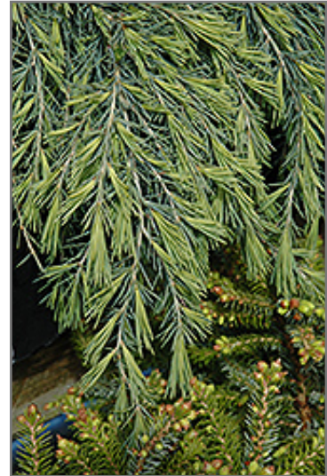
Feelin' Blue Deodar Cedar foliage