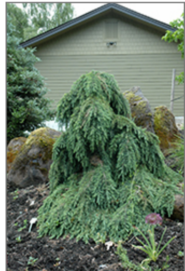
Feelin' Blue Deodar Cedar