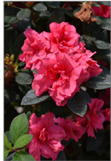
Encore Autumn Rouge Azalea flowers

Encore Autumn Rouge Azalea will grow to be about 4 feet tall at maturity, with a spread of 4 feet. It tends to be a little leggy, with a typical clearance of 1 foot from the ground. It grows at a slow rate, and under ideal conditions can be expected to live for 40 years or more.