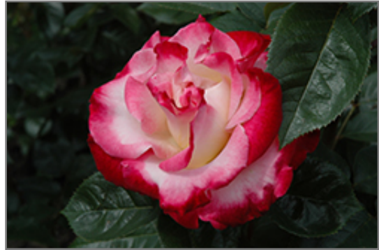
Dick Clark Rose flowers