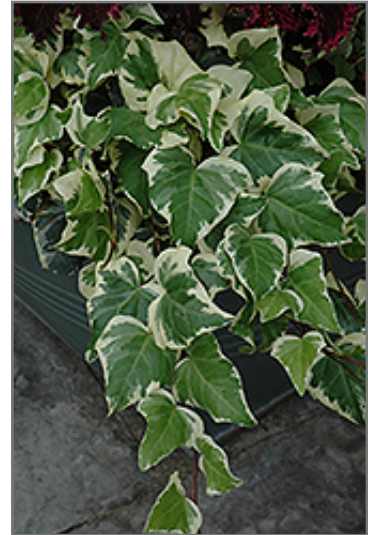
Gloire de Marengo Ivy foliage