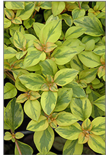
Walkabout Sunset Loosestrife foliage

Walkabout Sunset Loosestrife is recommended for the following landscape applications;