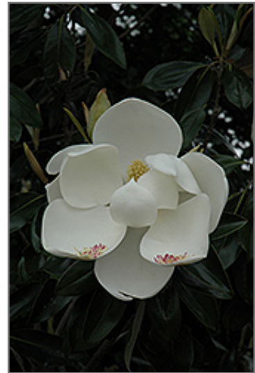
Teddy Bear Magnolia flowers