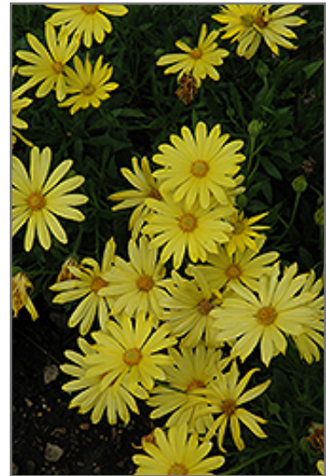
Voltage Yellow African Daisy flowers