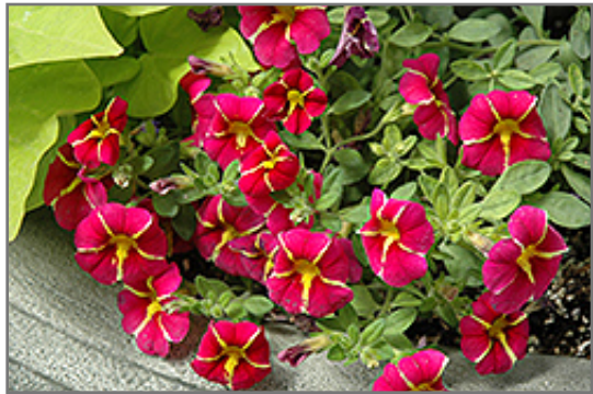
Superbells Cherry Star Calibrachoa flowers