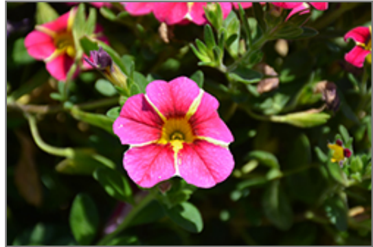
Superbells Cherry Star Calibrachoa flowers

Superbells Cherry Star Calibrachoa is a dense herbaceous annual with a trailing habit of growth, eventually spilling over the edges of hanging baskets and containers. Its medium texture blends into the garden, but can always be balanced by a couple of finer or coarser plants for an effective composition.