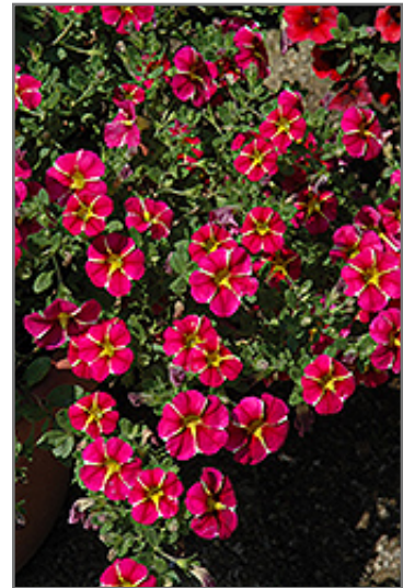
Superbells Cherry Star Calibrachoa flowers