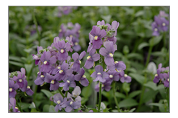
Bluebird Nemesia flowers