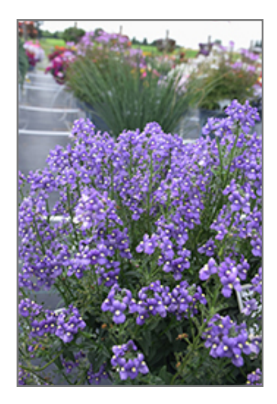
Bluebird Nemesia flowers

Thousand Oaks Location 2585 Thousand Oaks San Antonio, TX 78232 (210) 494-6131