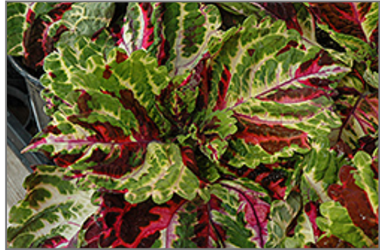
Kong Mosaic Coleus foliage