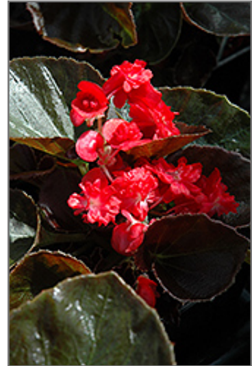
Doublet Red Begonia flowers