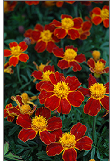
Disco Red Marigold flowers

Disco Red Marigold features bold dark red daisy flowers with yellow eyes and yellow edges at the ends of the stems from late spring to late summer. The flowers are excellent for cutting. Its fragrant ferny leaves remain dark green in color throughout the season.