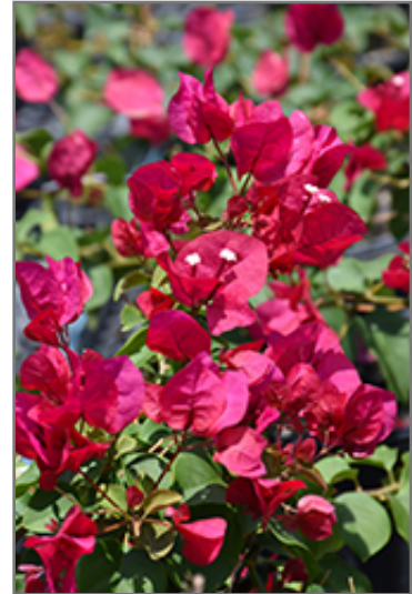
Barbara Karst Bougainvillea flowers