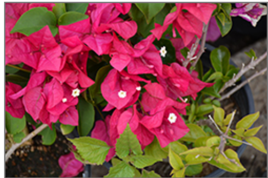
Barbara Karst Bougainvillea flowers