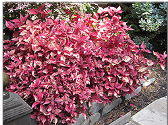
Blood Leaf