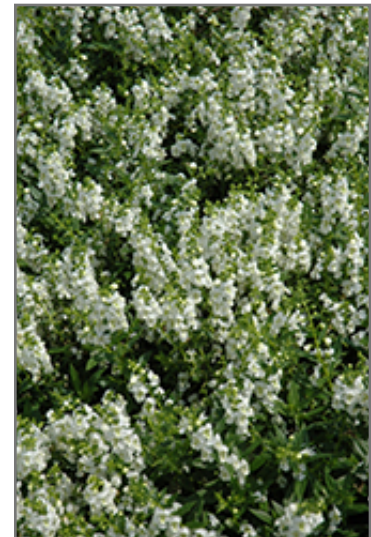
Serenita White Angelonia flowers