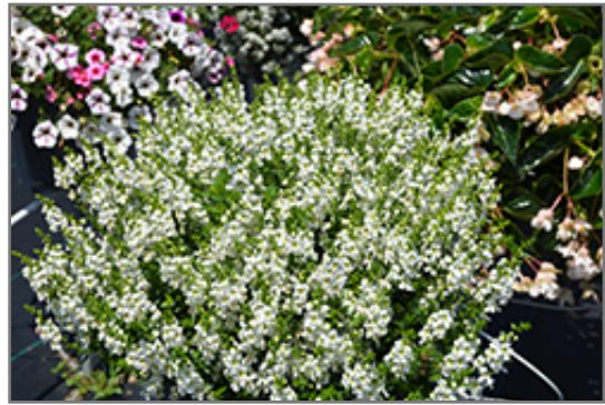
Serenita White Angelonia flowers