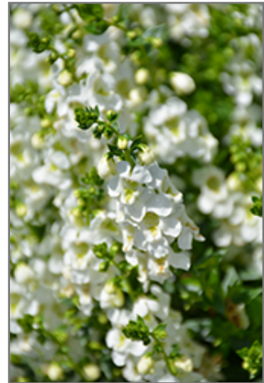
Serenita White Angelonia flowers

Serenita White Angelonia is an herbaceous evergreen perennial with an upright spreading habit of growth. Its relatively fine texture sets it apart from other garden plants with less refined foliage.