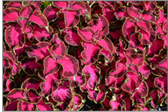
Chocolate Covered Cherry Coleus foliage

Chocolate Covered Cherry Coleus is a fine choice for the garden, but it is also a good selection for planting in outdoor containers and hanging baskets. It is often used as a 'filler' in the 'spiller-thriller-filler' container combination, providing a canvas of foliage against which the larger thriller plants stand out. Note that when growing plants in outdoor containers and baskets, they may require more frequent waterings than they would in the yard or garden.