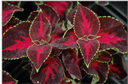
Chocolate Covered Cherry Coleus foliage