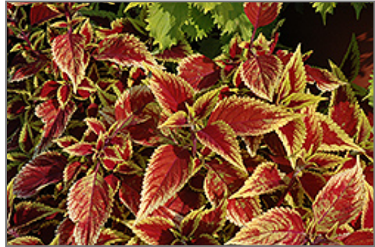
Defiance Coleus foliage