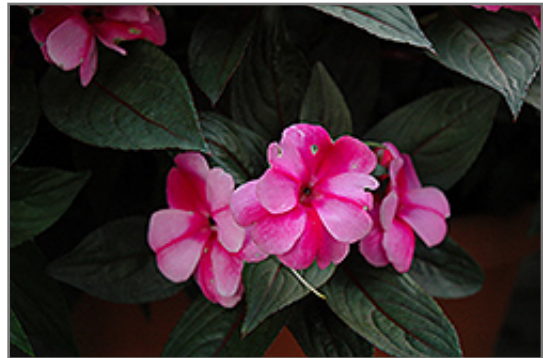
Celebration Purple Star New Guinea Impatiens flowers

Celebration Purple Star New Guinea Impatiens is recommended for the following landscape applications;