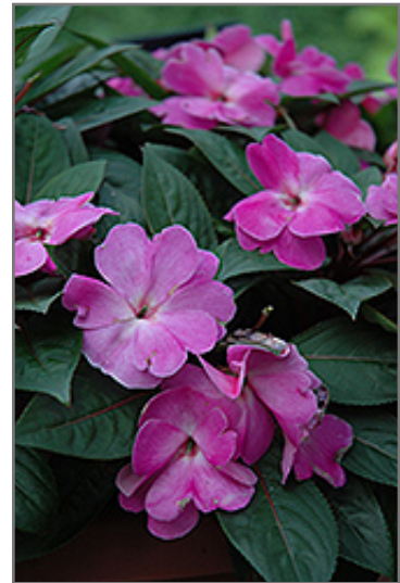
Celebrette Orchid New Guinea Impatiens flowers

A lovely self-cleaning variety needing little to no maintenance, perfect for garden beds, borders and containers; well branched, mounded habit with excellent shade tolerance; large, vibrant flowers nestle atop deep green foliage on compact plants