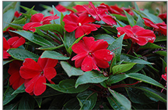
Celebrette Red New Guinea Impatiens flowers