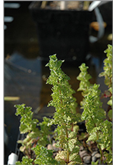
Curly Mint foliage

Aside from its primary use as an edible, Curly Mint is suitable for the following landscape applications;