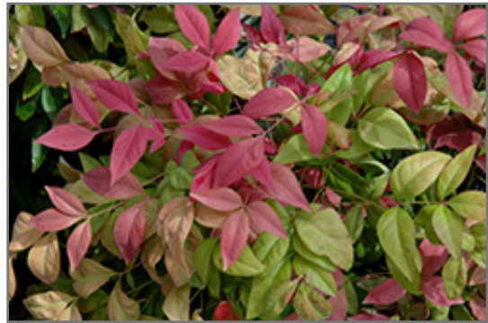
Blush Pink Nandina foliage

Blush Pink Nandina is recommended for the following landscape applications;