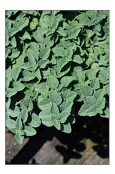
Hot And Spicy Oregano foliage

Aside from its primary use as an edible, Hot And Spicy Oregano is sutiable for the following landscape applications;