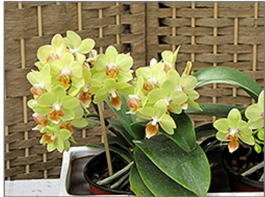
Hybrid Moth Orchid in bloom

When grown indoors, Hybrid Moth Orchid can be expected to grow to be only 6 inches tall at maturity extending to 12 inches tall with the flowers, with a spread of 6 inches. It grows at a slow rate, and under ideal conditions can be expected to live for approximately 10 years. This houseplant should only be grown away from direct sunlight or in a room with strong artificial light. It does best in average to evenly moist soil, but will not tolerate standing water. The surface of the soil shouldn't be allowed to dry out completely, and so you should expect to water this plant once and possibly even twice each week. Be aware that your particular watering schedule may vary depending on its location in the room, the pot size, plant size and other conditions; if in doubt, ask one of our experts in the store for advice. It is not particular as to soil type or pH; an average potting soil should work just fine.