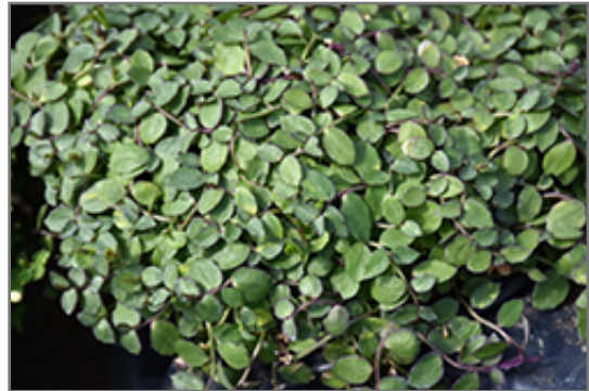
County Park Star Creeper foliage