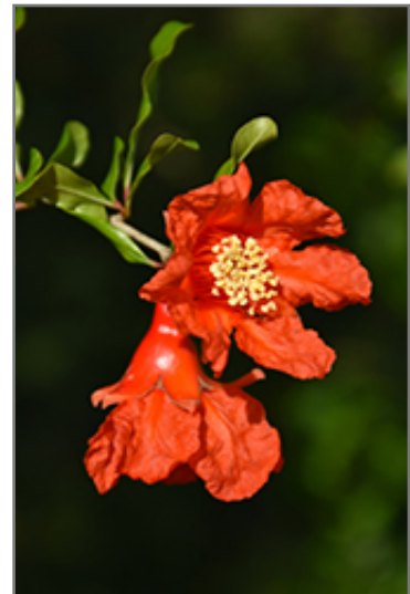
Pomegranate flowers