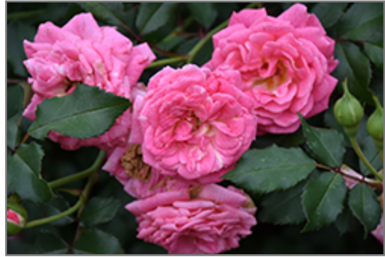
Sweet Drift Rose flowers

This shrub should only be grown in full sunlight. It does best in average to evenly moist conditions, but will not tolerate standing water. It may require supplemental watering during periods of drought or extended heat. It is not particular as to soil type or pH. It is highly tolerant of urban pollution and will even thrive in inner city environments. This particular variety is an interspecific hybrid.