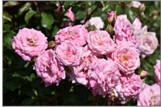
Sweet Drift Rose flowers

Sweet Drift Rose is recommended for the following landscape applications;