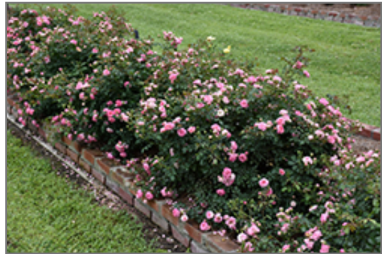
Sweet Drift Rose in bloom