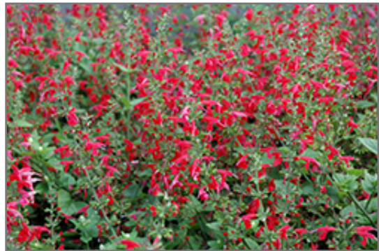
Summer Jewel Red Sage flowers