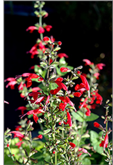
Summer Jewel Red Sage flowers

Summer Jewel Red Sage is recommended for the following landscape applications;