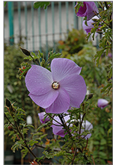
Santa Cruz Lilac Hibiscus flowers