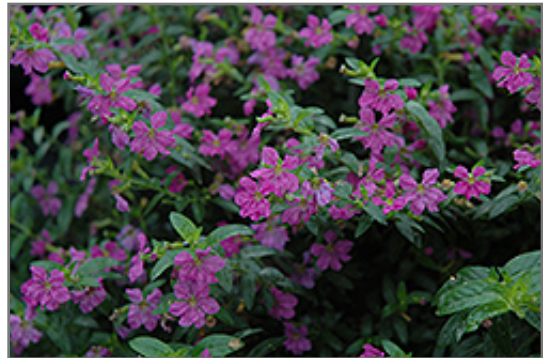
Allyson Mexican Heather flowers