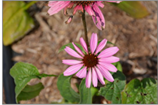
Primadonna Deep Rose Coneflower flowers