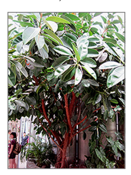
Rubber Tree