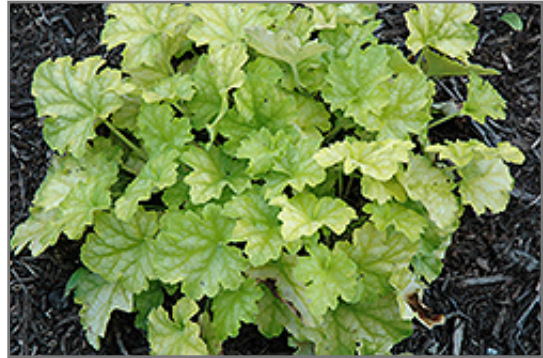
Carnival Limeade Coral Bells foliage

Carnival Limeade Coral Bells is recommended for the following landscape applications;