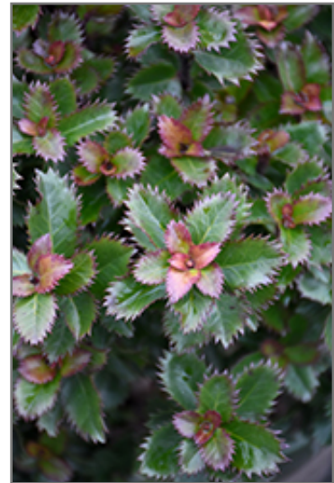
Sallywag Holly foliage