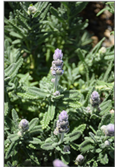
French Lavender flowers

French Lavender makes a fine choice for the outdoor landscape, but it is also well-suited for use in outdoor pots and containers. Because of its height, it is often used as a 'thriller' in the 'spiller-thriller-filler' container combination; plant it near the center of the pot, surrounded by smaller plants and those that spill over the edges. It is even sizeable enough that it can be grown alone in a suitable container. Note that when grown in a container, it may not perform exactly as indicated on the tag - this is to be expected. Also note that when growing plants in outdoor containers and baskets, they may require more frequent waterings than they would in the yard or garden.