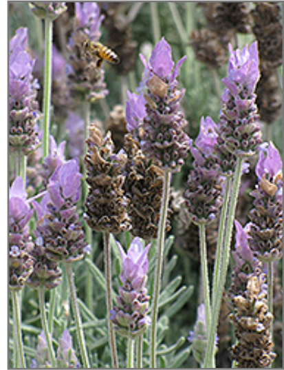
French Lavender flowers

French Lavender is recommended for the following landscape applications;