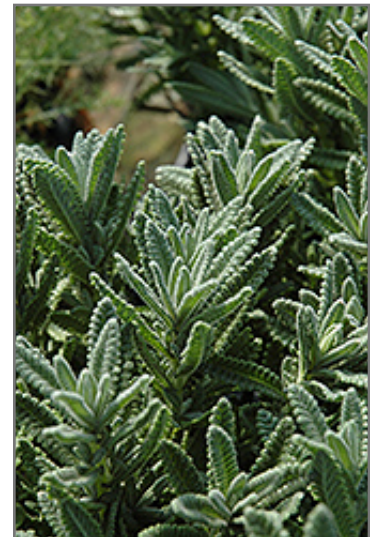
French Lavender foliage