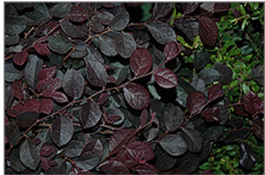
Purple Prince Fringeflower foliage

Purple Prince Fringeflower will grow to be about 6 feet tall at maturity, with a spread of 6 feet. It tends to fill out right to the ground and therefore doesn't necessarily require facer plants in front, and is suitable for planting under power lines. It grows at a medium rate, and under ideal conditions can be expected to live for 40 years or more.