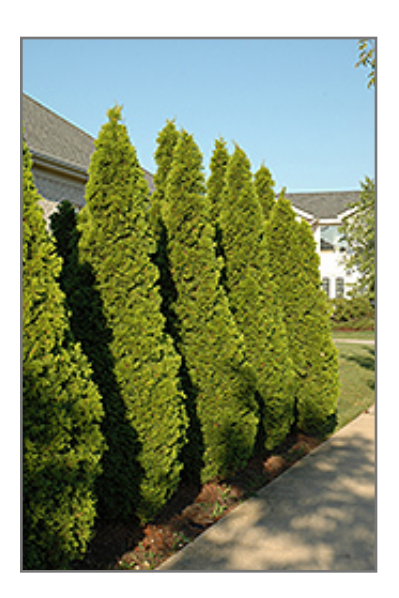
Emerald Green Arborvitae

Bandera Location 8516 Bandera Road San Antonio, TX 78250 (210) 680-2394