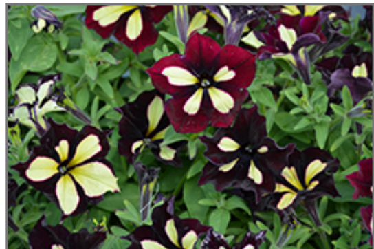
Crazytunia Star Jubilee Petunia flowers