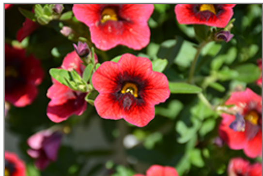
Superbells Pomegranate Punch Calibrachoa flowers