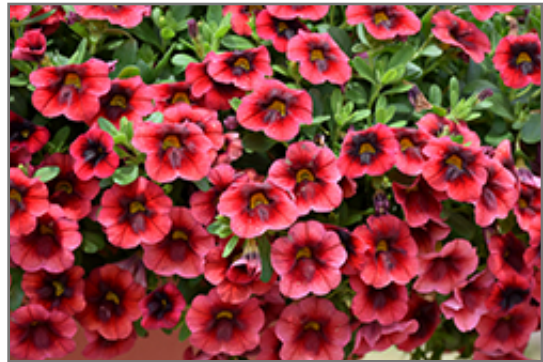
Superbells Pomegranate Punch Calibrachoa flowers

Superbells Pomegranate Punch Calibrachoa is recommended for the following landscape applications;