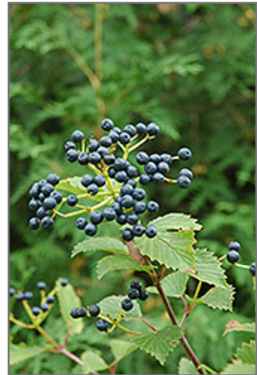
Blue Muffin Viburnum fruit

Blue Muffin Viburnum is recommended for the following landscape applications;